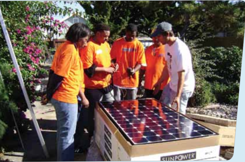
Solar Richmond graduates unpack solar panels

1002A O'Reilly Avenue San Francisco, CA 94129 415.561.3900