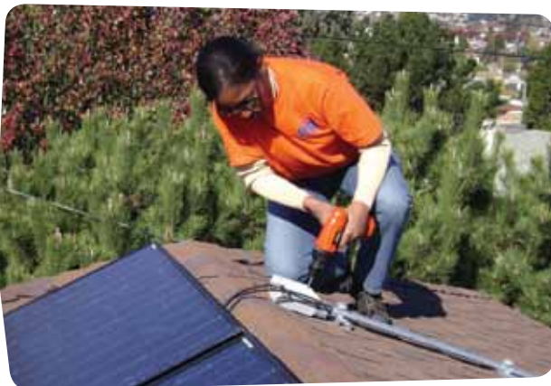
A Solar Richmond graduate installs panels on a neighborhood house

However, foundation staff often discover that making loans – a process which involves identifying and evaluating eligible projects, drafting loan terms, administering loans, and providing technical assistance to borrowers – requires staff expertise and back-end systems quite different than those required for making and evaluating grants.