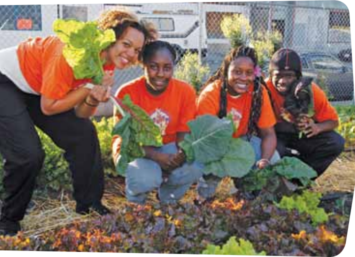
People's Grocery staff interns happily harvesting kale

> "People's Grocery" continued from page 5