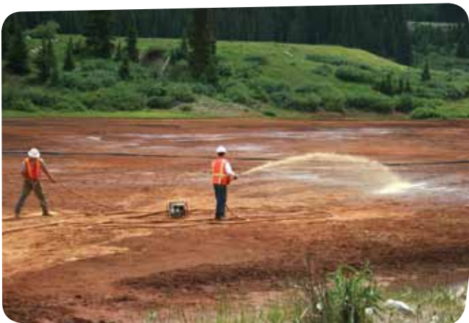
Tailing applicators spreading organic tall oil pitch

Another source of pride for my colleagues and me relates to developments in Northern Canada. We're establishing distributor relationships with Aboriginal tribes there that will provide them training and good jobs building and maintaining roads. They'll use socially responsible and sustainable products in ecologically fragile environments.