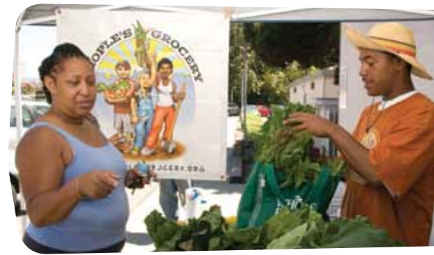
Shopping for organic produce at the mobile market